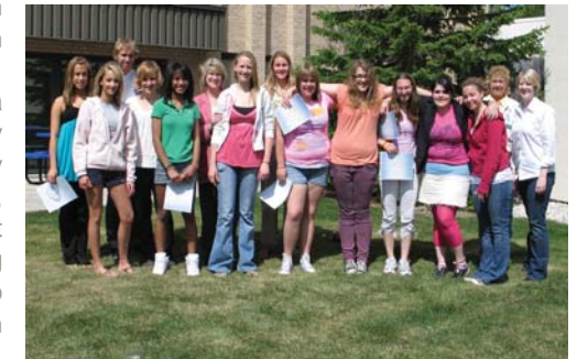
2008-09 ETC (Exposure to Creativity) mentor program participants.

The hands-on ETC workshops replaced Gibraltar High School's regular curriculum on two separate days – November 4 and 18, 2008 – and dealt with such diverse subjects as watercolor painting, glasswork, dance, theater, and poetry, among others. In total, 26 workshops were provided to all 217 GHS students. The mentor program, which utilized local artists and creative professionals, were held from February through May 2009. 13 students worked with six artist mentors for a