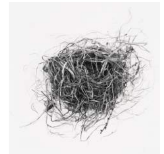
Images: Juror Terri Warpinski: Oak Road Field Study , Heins Creek , Abject Nest